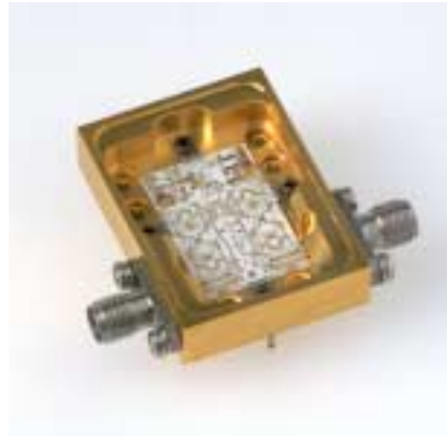
Subsystem before seam welding