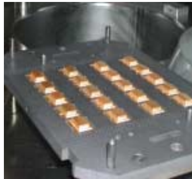
Hermetic soldered packages